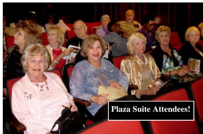
Plaza Suite Attendees!

See you next fall. Have a great summer! Darcy