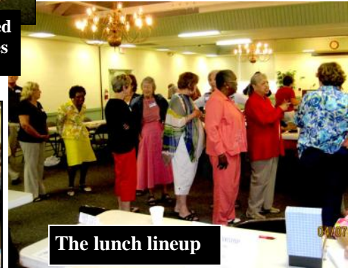
The lunch lineup