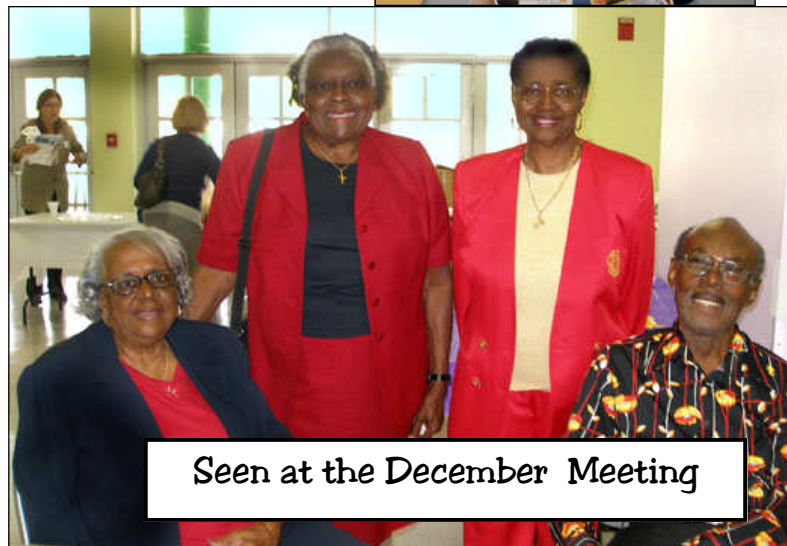
Seen at the December Meeting