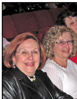
Scenes from the Doo - Wop Show