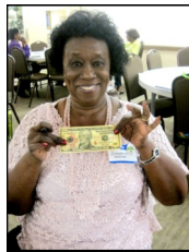
Winners in the